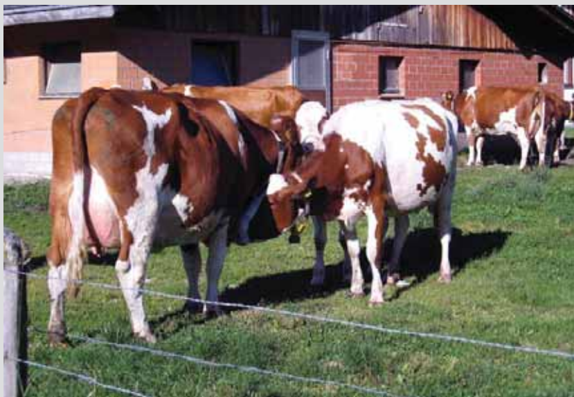
A herd of Simmental-Fleckvieh crossbred dairy cows in a Swiss farm.

Fleckvieh character: The breed is a dual-purpose cow that can be used for both dairy and beef production. Compared with the Holstein-Friesian, Fleckvieh produces less milk and is consistent in production; but it requires less feed to produce the same amount of milk as a Holstein-Friesian. Therefore it is an efficient cow. According to many comparison studies, done in Switzerland, Germany and also in South Africa, Fleckvieh gains faster weight than other breeds. It is less susceptible to diseases such as mastitis and even ECF. It has proved its qualities in the European lowlands as well in the mountains. These qualities